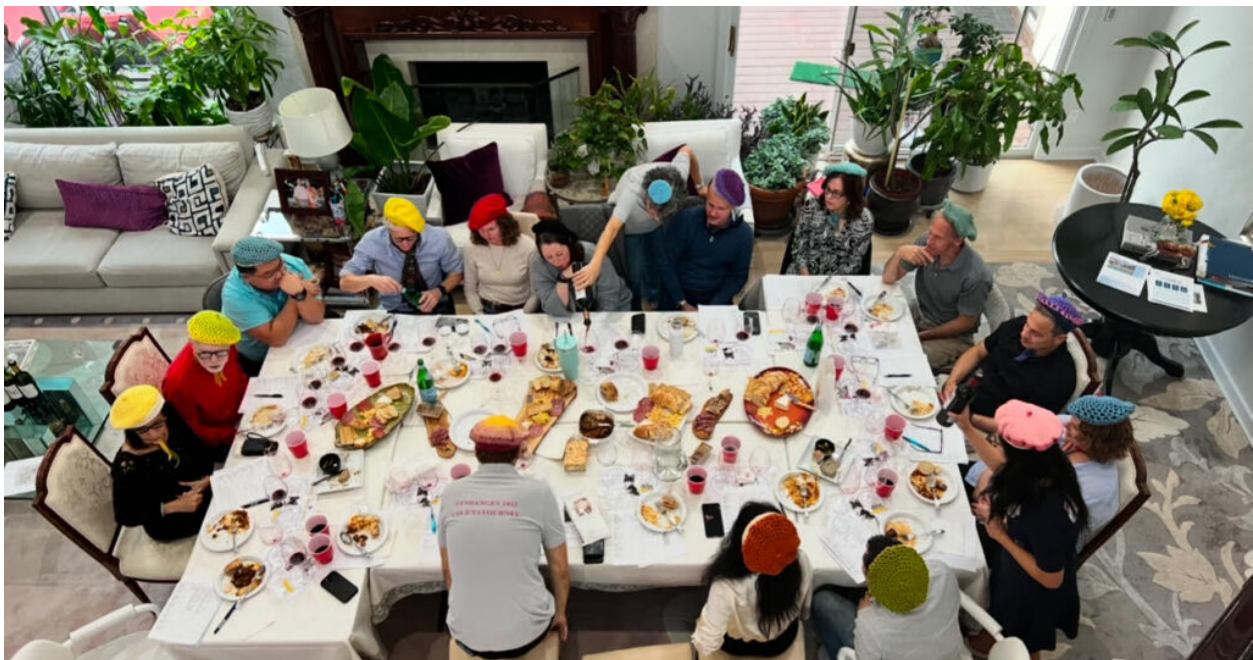
Members wore berets for this Bordeaux tasting

They now meet once a month. A member will propose a theme, buy the wines and everyone will split the cost. That member presents the wines and talks about the theme. Among recent events: a French tasting at which everyone wore berets and a vintage taste-off with a newer and older vintage of the same wine. They do a bubbly tasting every winter.